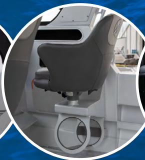
Dive bottle holder