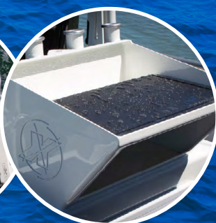
Small box style bait station (510 mm wide)