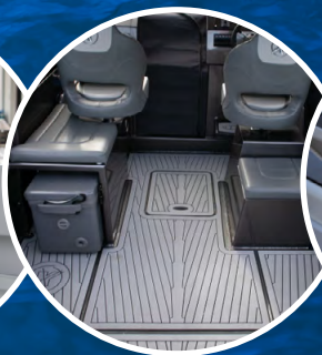
Storm grey over black king plank