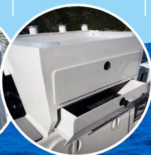
Bait station with 2 drawers