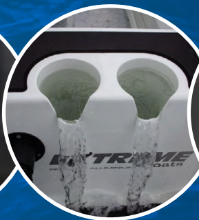
Twin tuna tubes