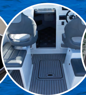
Chilly bin module with King Queen