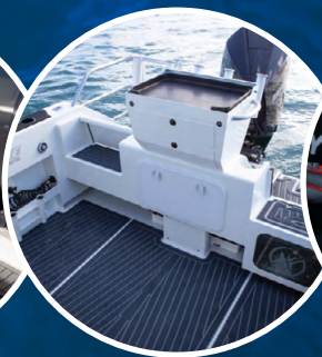
Dark grey over light grey king plank