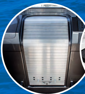
Lockable roller door