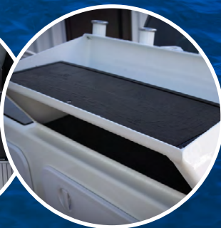
Large box style bait station (760mm wide)