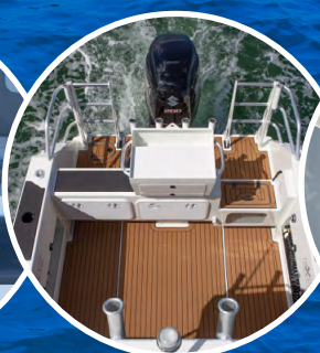
Mocha over black straight lines