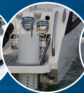
Through swimstep burley muncher