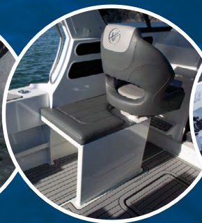
Chilly bin module