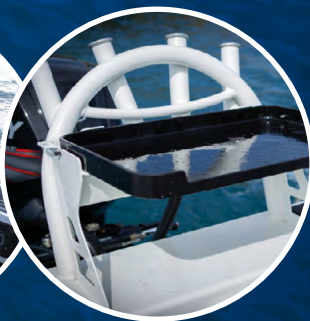
Standard hoop style bait board