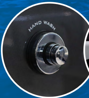
Knee hand wash